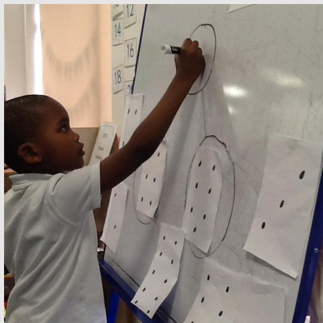
Exploring number and shape