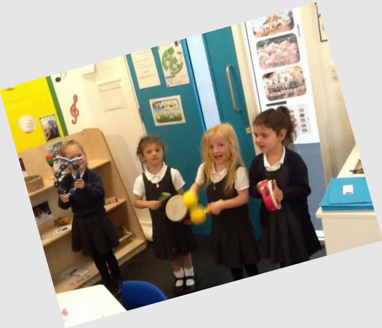
Music area where you can create your own sounds and dances.

I would like to show you some of the wonderful areas you can explore in the unit.