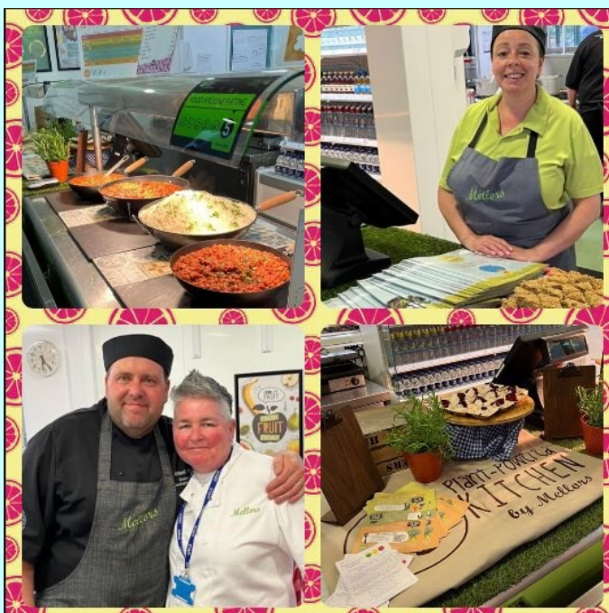
Academies' caterers Mellor's giving parent/carers a sample of their nutritious food at the Year 7 Induction Evening