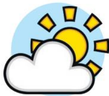
sunny and cloudy

Can you draw the different weather symbols? Which symbol would you use to show the weather today?