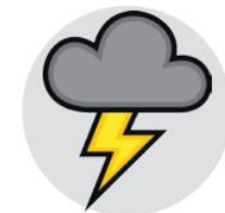
thunder and lightning